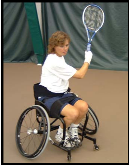
High to low racquet path

Since the racquet path is the key element, it is critical that a player becomes kinesthetically aware of the path they create: